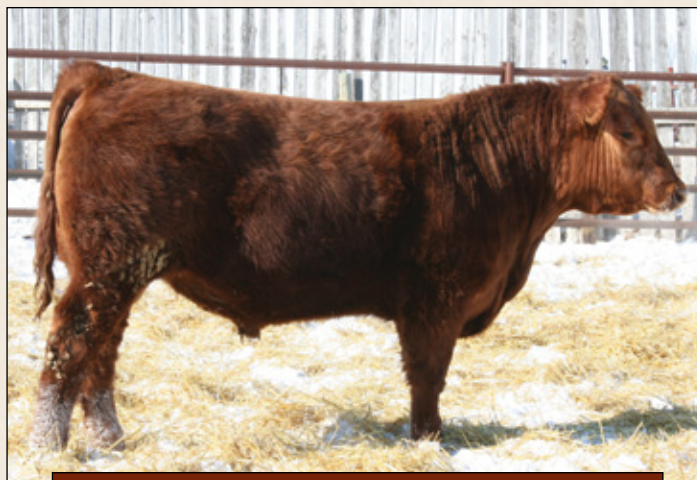
Lot 20: Panther 29A