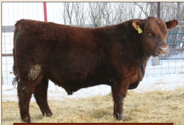
Lot 9: Grisdale 76A