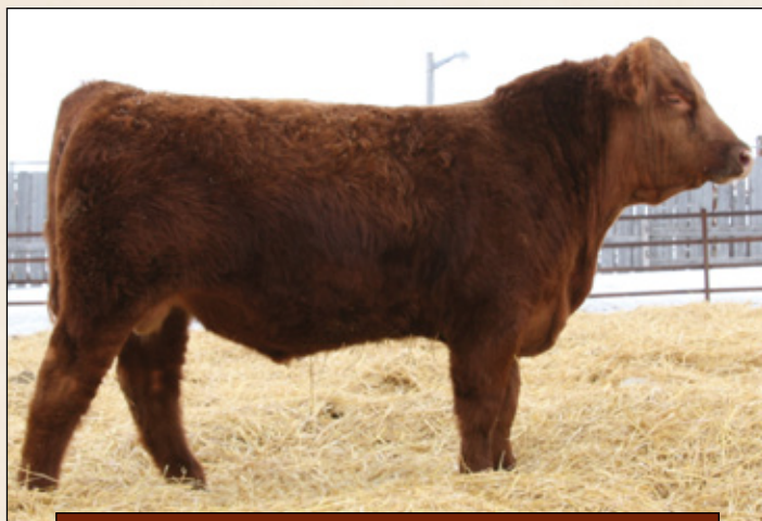
Lot 1: Coppin 49A