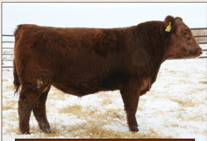
Lot 21: Skipper 32A