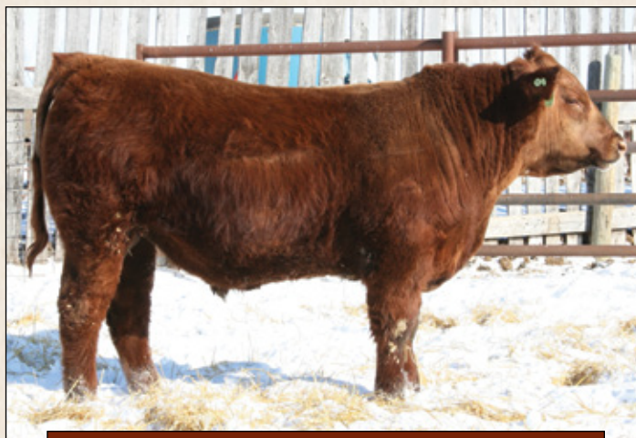
Lot 29: Bantam 139A