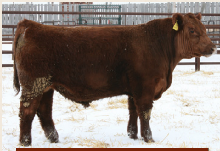
Lot 8: Riptide 84A