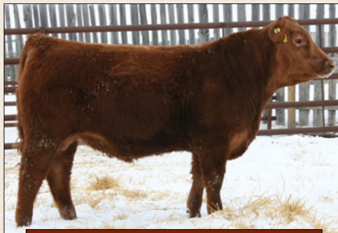
Lot 22: Fergus 11A