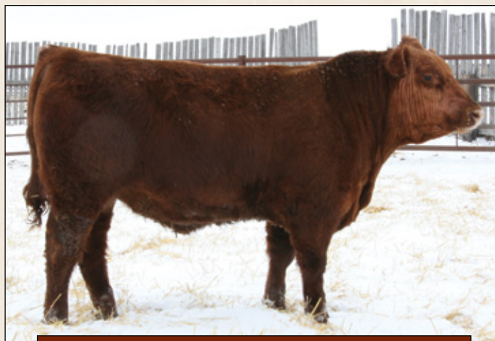
Lot 26: Thumper 30A