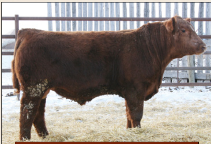
Lot 27: Marcella 4A