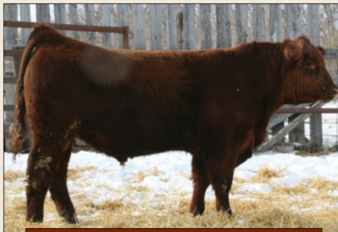
Lot 14: Target 164A