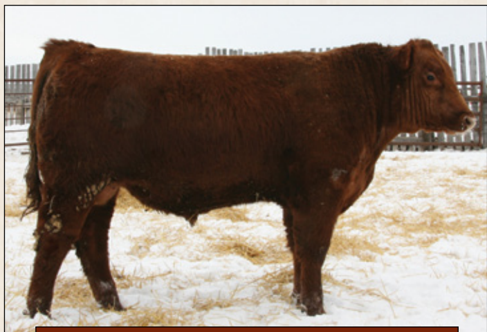
Lot 28: Ripzone 149A