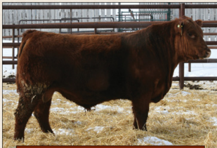
Lot 37: Blaster 60A