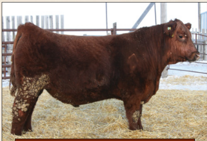
Lot 33: Woodrow 89A