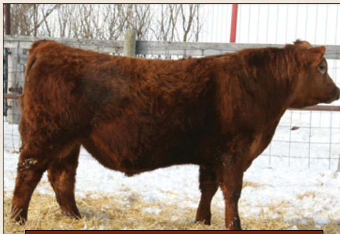
Lot 34: Budy 146A