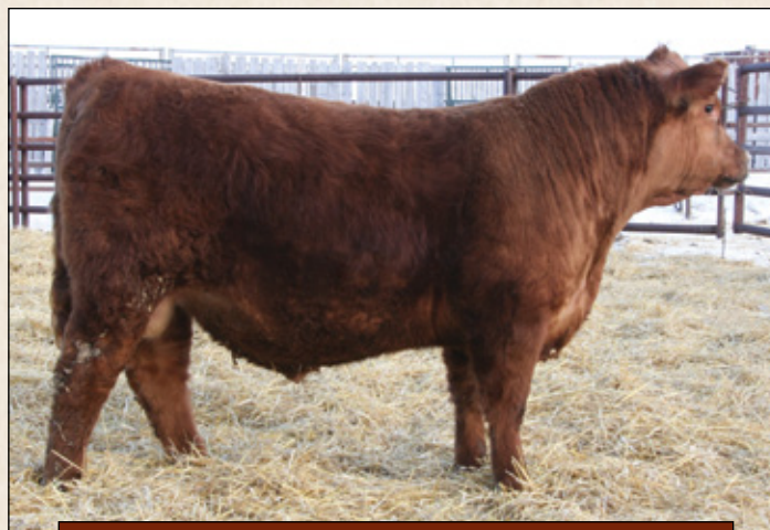
Lot 7: Bjorn 53A