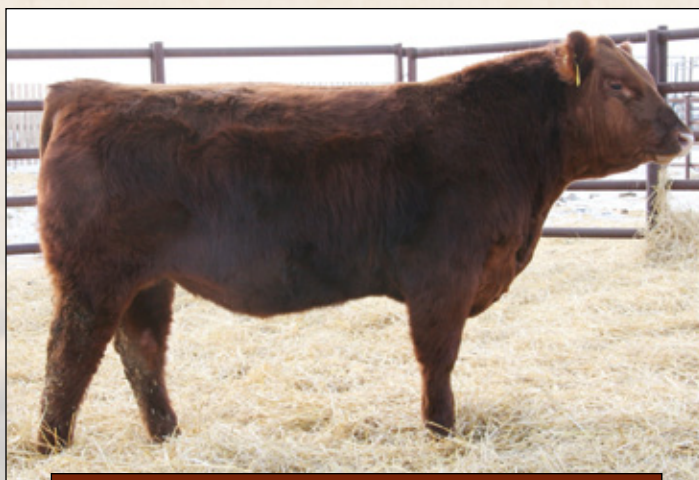
Lot 25: Tremor 36A