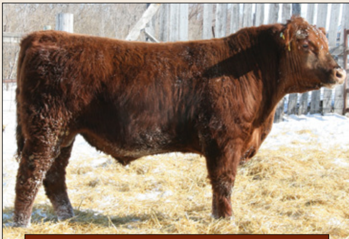
Lot 4: Szarka 26A