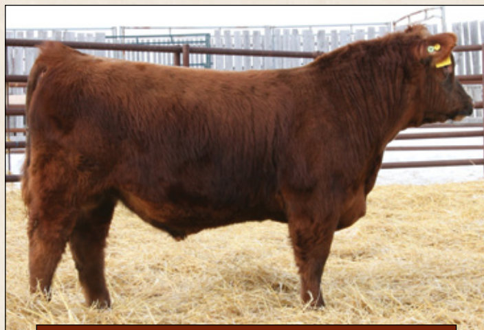
Lot 5: Harpoon 21A