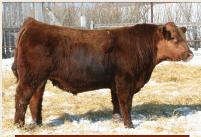
Lot 18: Weldon 3A