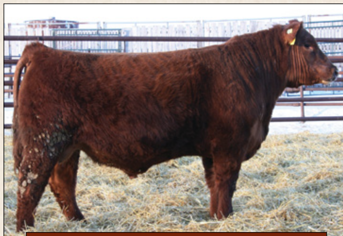
Lot 38: Raptor 67A