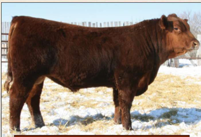
Lot 11: Denver 70A