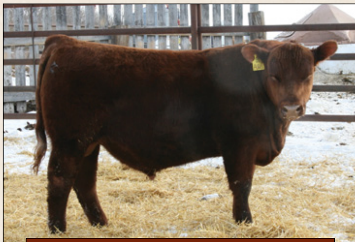
Lot 13: Boxcar 102A