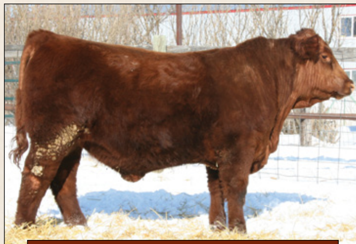
Lot 2: Ace 45A