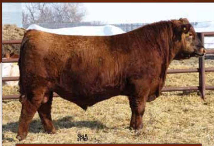
Lot 1: Mansfield 56X