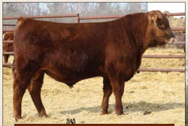
Lot 38: Design 1045X-ET