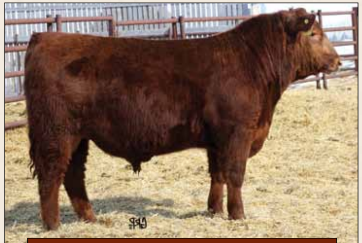
Lot 10: Binge 24X