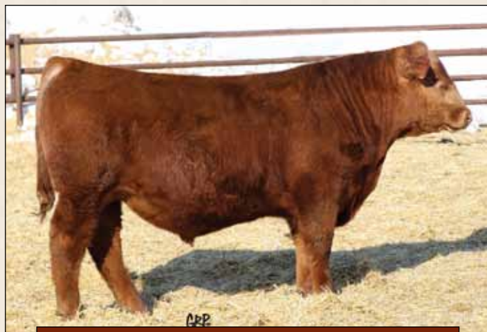
Lot 21: Banjo 90X