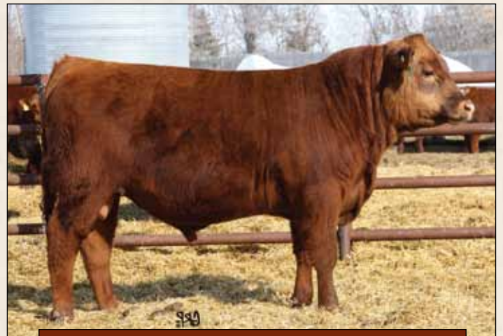
Lot 32: Mambo 1013X