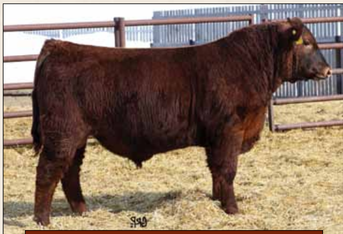
Lot 7: Midas 10X