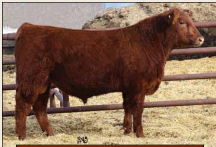
Lot 31: Ryan 11X