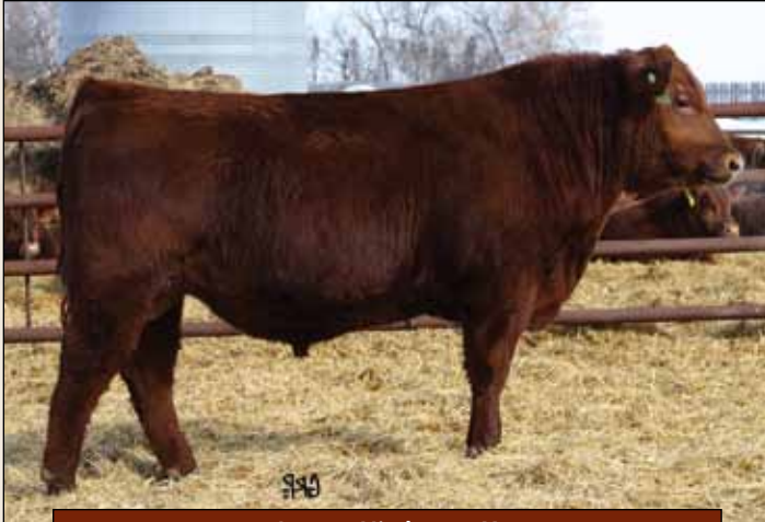
Lot 24: Hitch 1040X