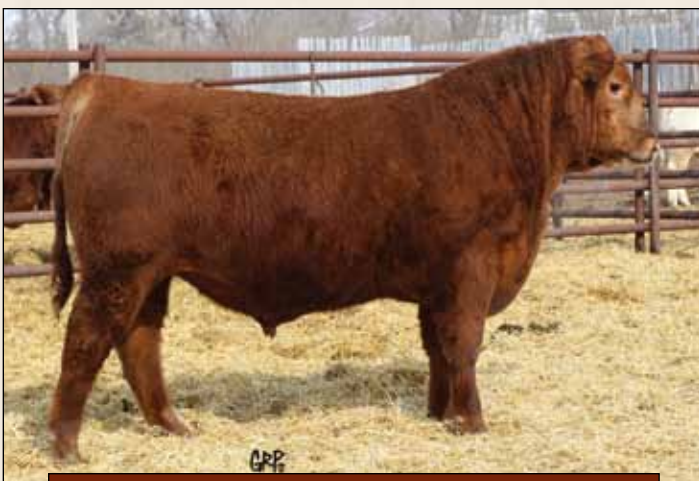
Lot 34: Cannon 1065X