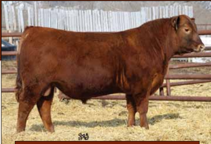
Lot 13: Flair 60X