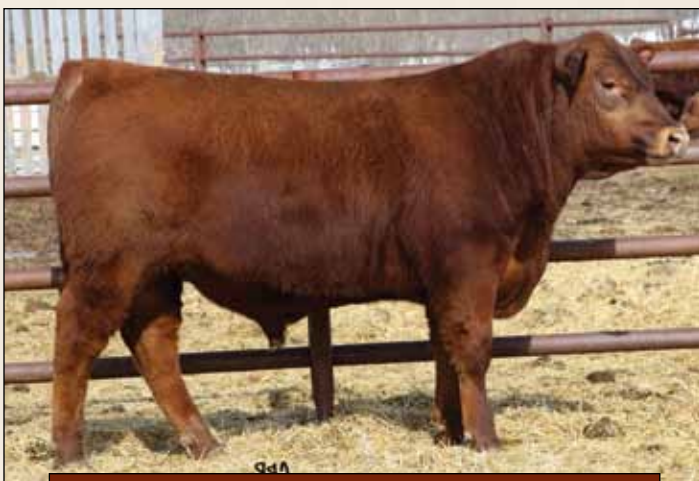
Lot 19: No Doubt 91X