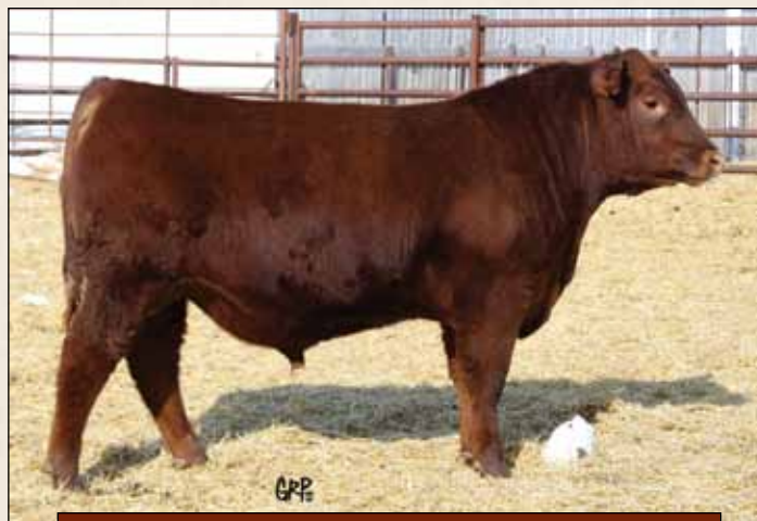
Lot 20: Branden 94X