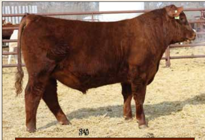
Lot 36: Giddeyup 1018X