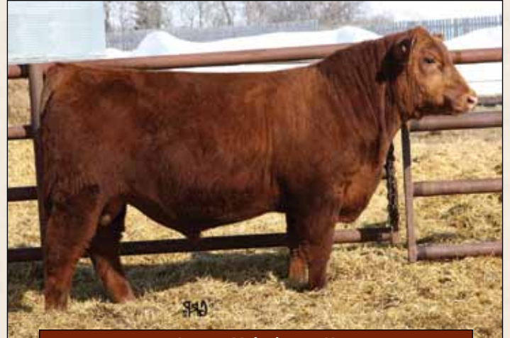
Lot 25: Malcolm 101X