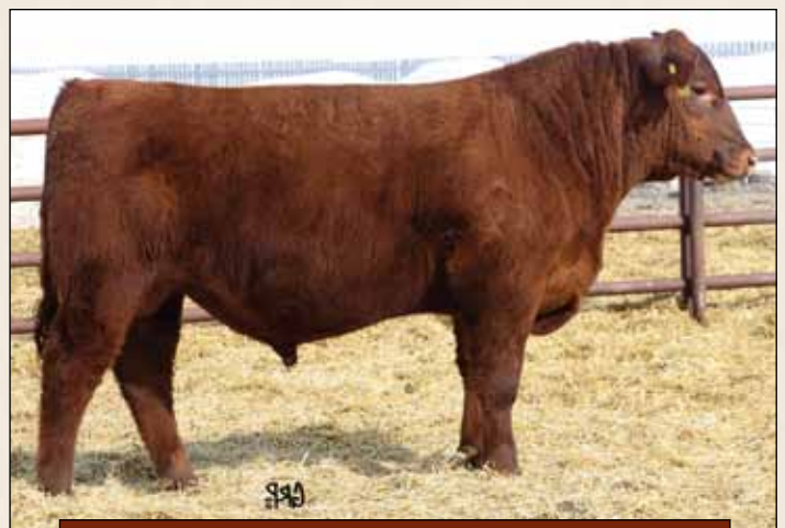
Lot 22: Dressler 85X