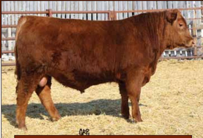
Lot 26: Bangor 89X