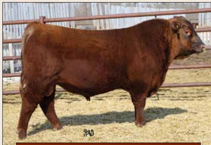
Lot 4: Churchill 14X