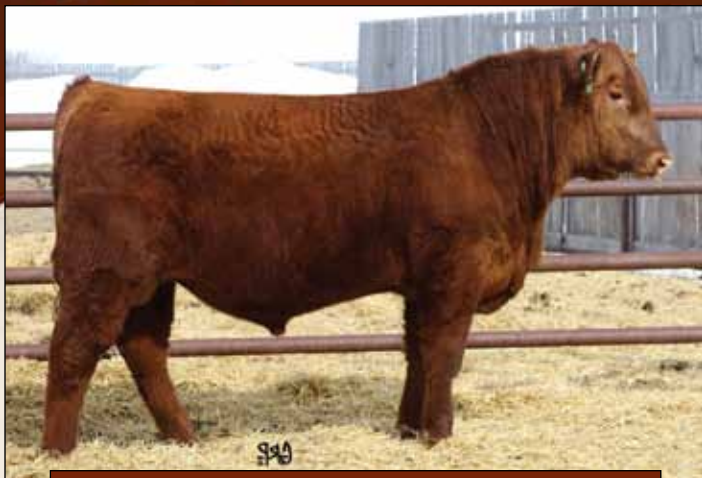
Lot 37: Designex 1038X-ET