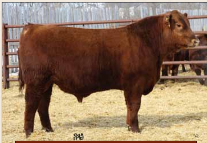
Lot 8: Roost 17X