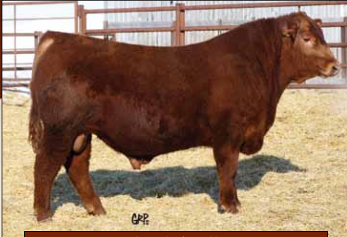
Lot 2: Larict 63X