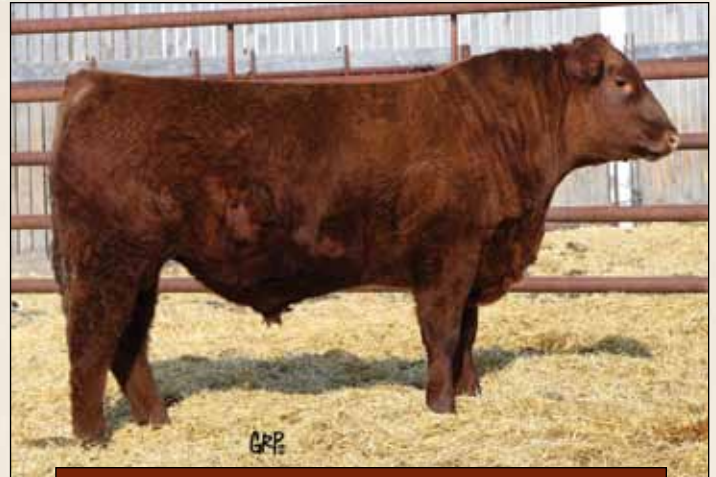
Lot 29: Rendeau 64X