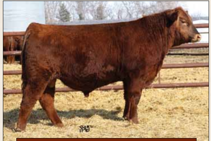
Lot 16: Trigger 41X-ET