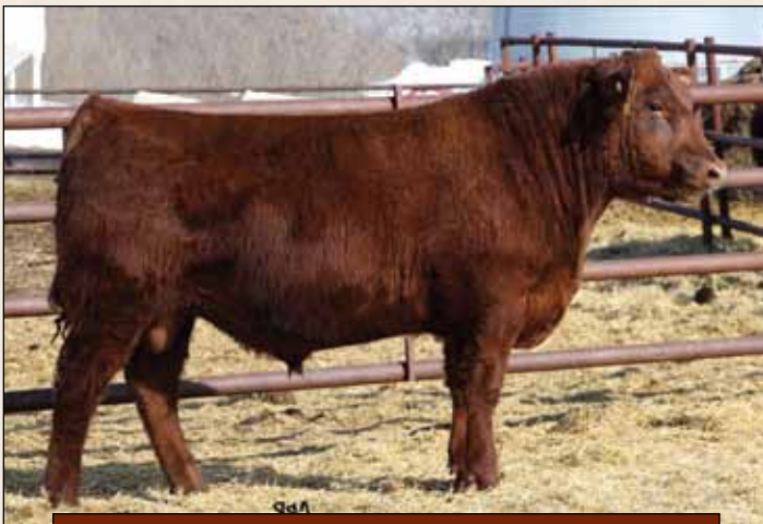
Lot 27: Download 81X