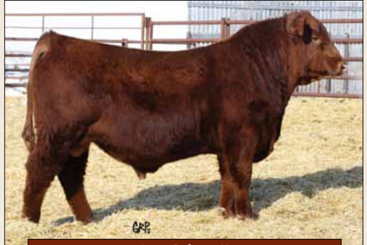
Lot 5: Rafter 48X