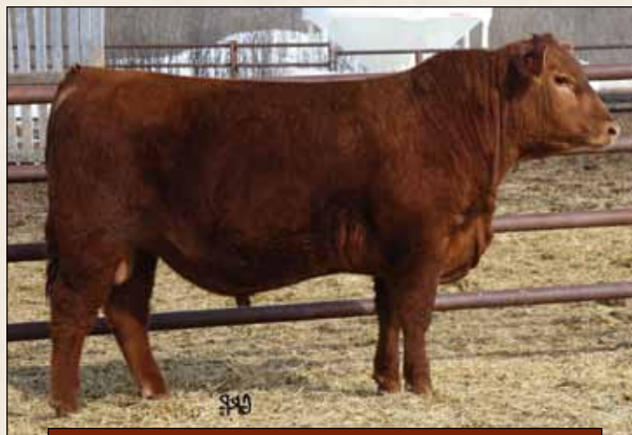
Lot 30: Trapper 22X