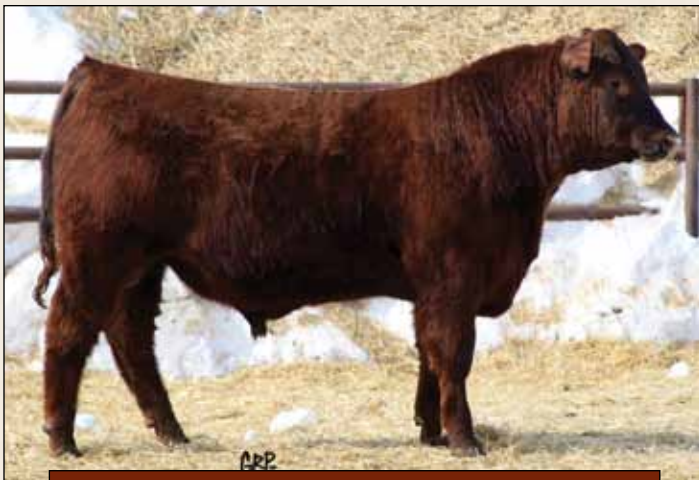
Lot 9: Buzzsaw 35X