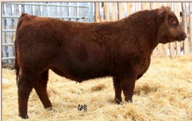
Lot 31: Ben 85W