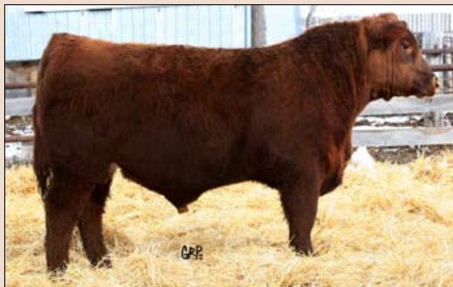
Lot 20: Tremor 42W

RED SIX MILE OUTBACK 219P Dam: RED KAYMAC TAMAR 724T MGS: RED T-K DUSTER 10K