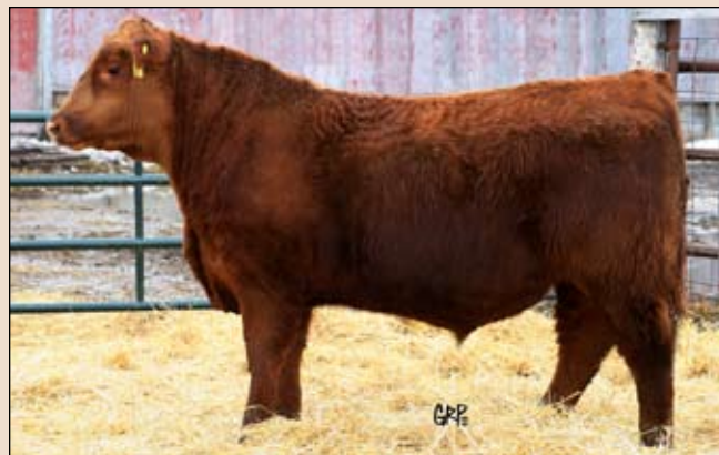
Lot 32: Tandem 99W