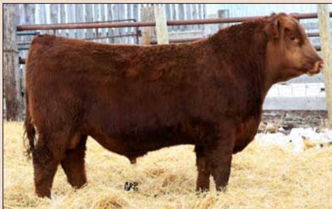
Lot 6: Lash Out 45W