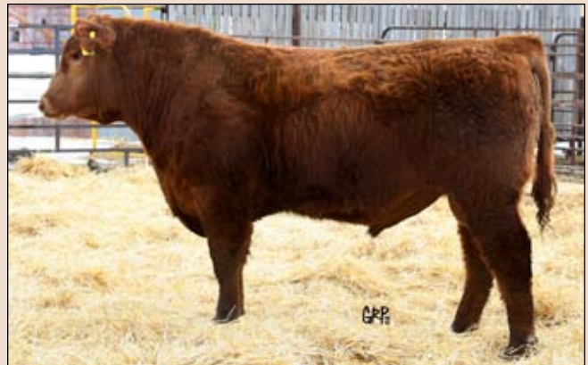
Lot 24: Tanner 39W