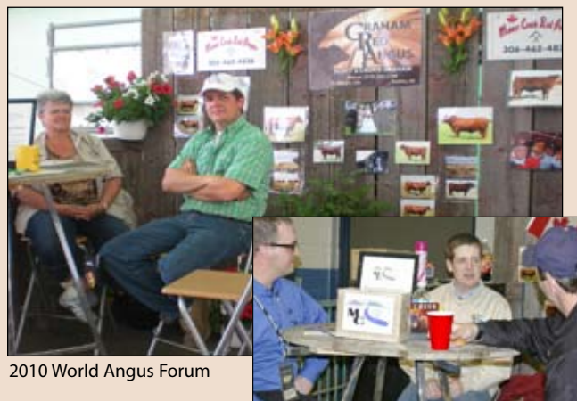
2010 World Angus Forum

The cows are culled at branding time; about 30% of our cowherd annually. We cull very hard on feet, udders, fleshing ability, production and temperament. Even if a so-so cow has an impressive bull calf at side, she is mated terminal and her calf is castrated, finished and data collected on it.