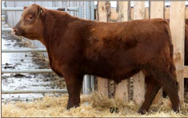
Lot 13: Dominor 717W