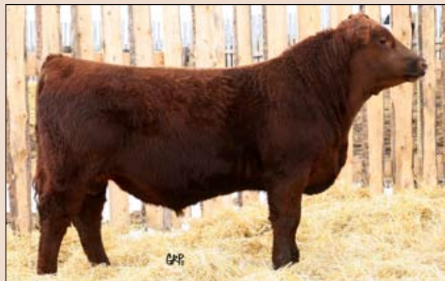
Lot 28: Lock Down 47W