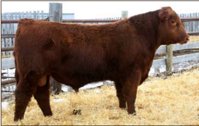
Lot 5: Zing 43W