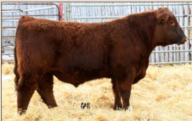
Lot 1: Rios 75W