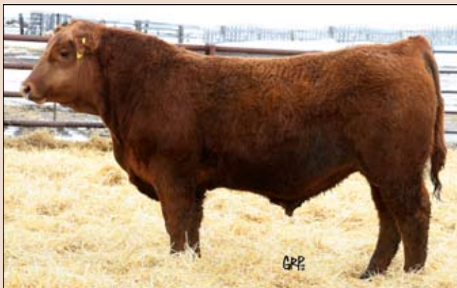
Lot 33: Notch 108W