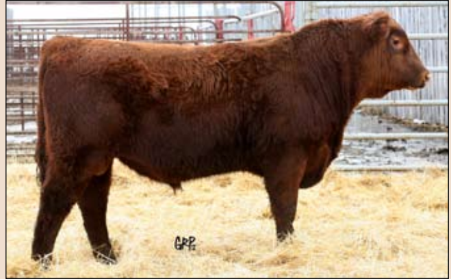
Lot 22: Pelly 53W-ET