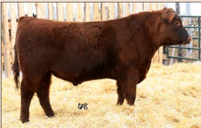
Lot 10: Buckshot 82W