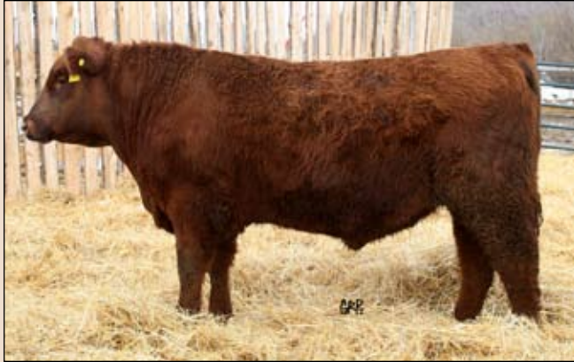
Lot 21: Panther 91W