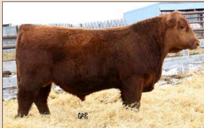
Lot 25: Torque 19W