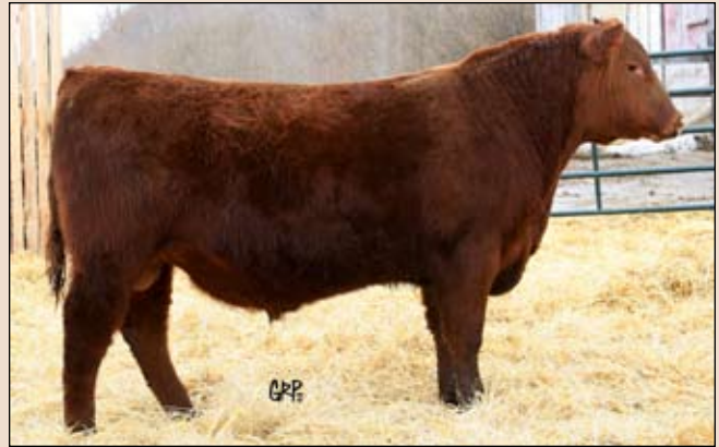
Lot 17: Squall 705W