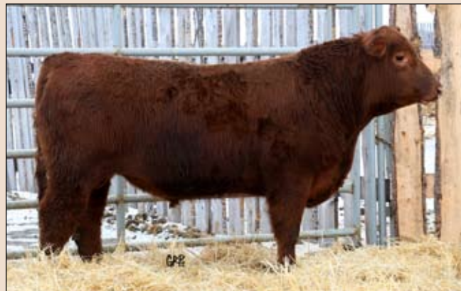
Lot 36: Wapoose 745W