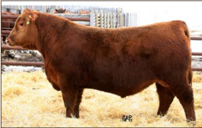
Lot 15: Winslow 744W