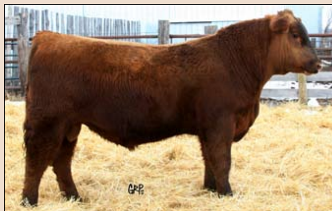
Lot 30: Marshall 63W

The best promotion of performance based calves would have to be your local stock yard this fall. The more "pay weight" you brought to town, the bigger the cheque you took home. This was evident everywhere on all classes of cattle. Therefore, it is very important to make sure that you are using performance tested, big pay weight bulls. As so many producers move to later calving, the pay weight and conversion of their calves suffer. Some of this has to do with changing their focus from power bulls to calving ease bulls but a great deal has to do with the use of long yearlings and off age two year old bulls. These bulls are not selected, fed or tested to be bulls with pay weight. They are fed to be athletic and sound; basically the responsible way to feed all bulls. They have little to no information on their ability to sire conversion or performance. Since 73% of all cattle are slaughtered between the ages of 14-18 months, isn't it important to evaluate ADG and feed conversion in the genetics that will dominate your calf crop?