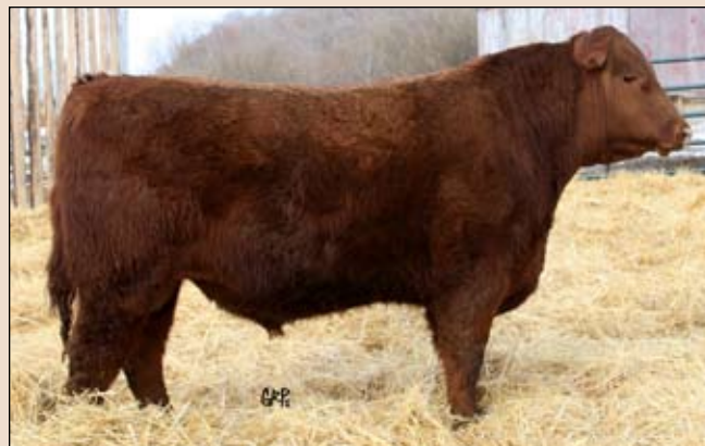
Lot 12: Spitz 97W