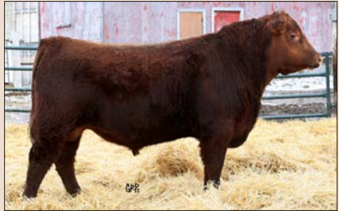
Lot 14: Crowfoot 736W