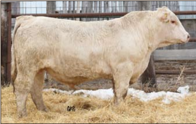
Lot 39: Powell 204W

These bulls should help you achieve those goals.