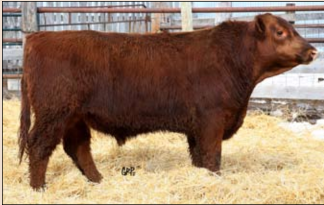
Lot 16: Whistler 769W