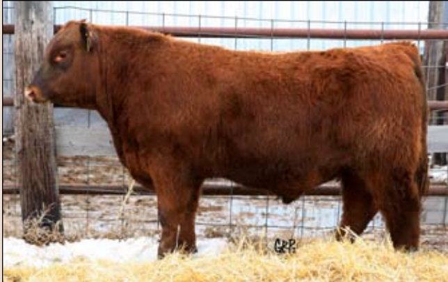
Lot 8: Ceylon 38W