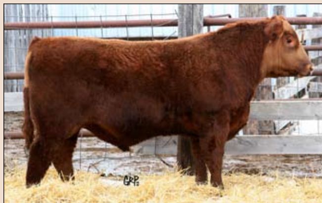
Lot 29: Primal 55W

Show ring accomplishments seem to consume most breeders advertising material lately. Ironically, this is in a time when cattle numbers are dropping drastically at all the shows and exhibits. Why? My guess is it has a lot to do with money. The lack of extra money that it takes to travel the circuit is part of it but the most important part is the lack of money that it is returning. Most, if not all, commercial producers are managing their operations in a manner that is almost 180 degrees to what the show ring is dictating. Swath grazing, bale grazing, stock piled forage and unpampered and hard working are things that they don't associate with over weight, over fed and non practical show cattle. These producers are not only intimidated by what they see but also uninterested. What kind of message are we sending when we talk about big bodied, easy doing cattle and then self feed the show calves expensive ration? We are certainly setting an example that they can and will not follow.