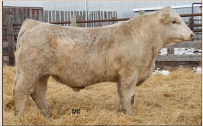
Lot 41: Pete 209W