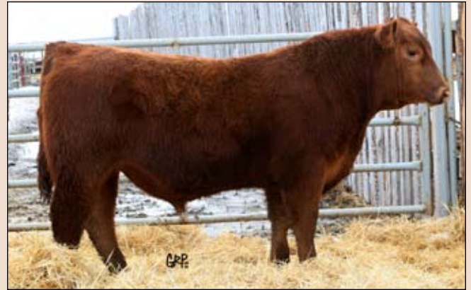
Lot 4: Canter 41W