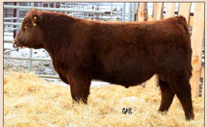
Lot 11: Galaxy 112W