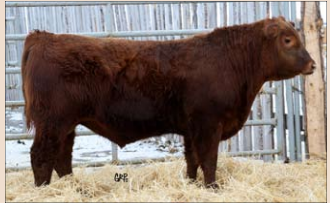
Lot 18: Walking Tall 714W