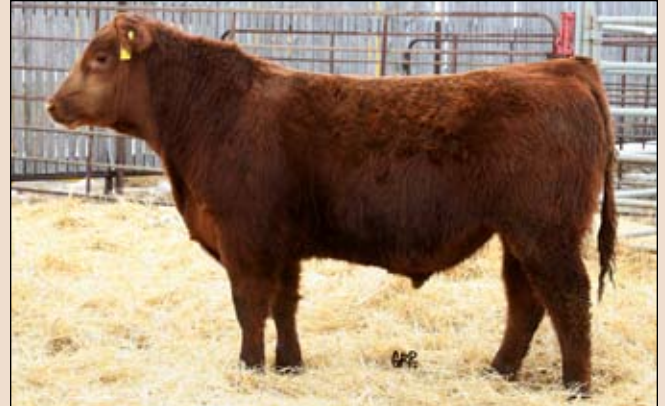
Lot 9: Deke 57W