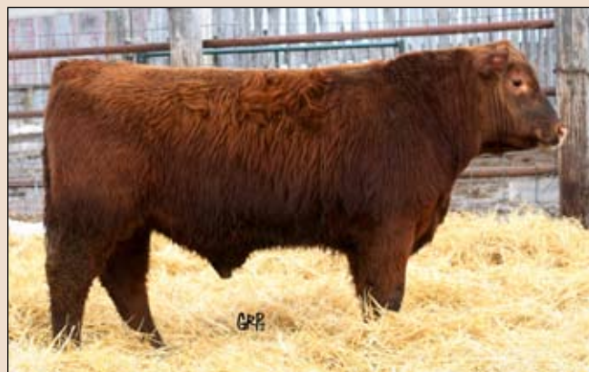
Lot 37: Script 751W-ET

There has been a move in the industry towards more "Forage" fed bulls. This in my opinion is a wise move. These bulls are fed a lower energy ration that should promote longevity and soundness. The only problem is that some of these "Forage" fed bulls are targeted for over 4.0 lbs/day gain. In the feedyard business, if you can get those kind of gains on slaughter cattle thru the feeding period, you are on an 85% Barley ration. As efficiency is equally as important as performance, the bull pen needs to be fed a disciplined ration to evaluate these traits instead of force feeding them to mask the problem. To achieve a consistently efficient bull pen, the cowherd has to be the first area of culling. Hard doing, thrifty and non functional cows can not be tolerated. Again, feeding these cows a balanced, cheap ration is the easiest way to remove the poor doers. Too many inefficient bulls keep being sold because of the pedigree, purchase price or show ring achievements of their mothers.