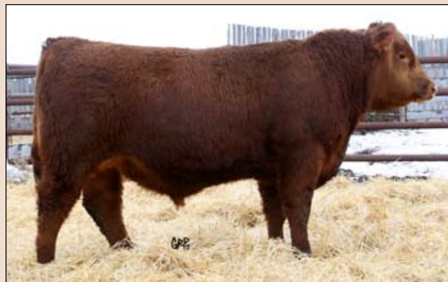
Lot 2: Zig 86W