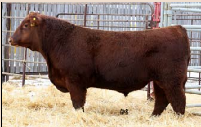
Lot 26: Maxwell 26W