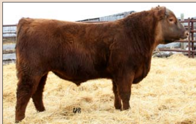
Lot 38: Jas Flute 37W-ET