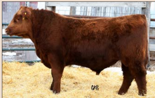
Lot 34: Boxcar 110W