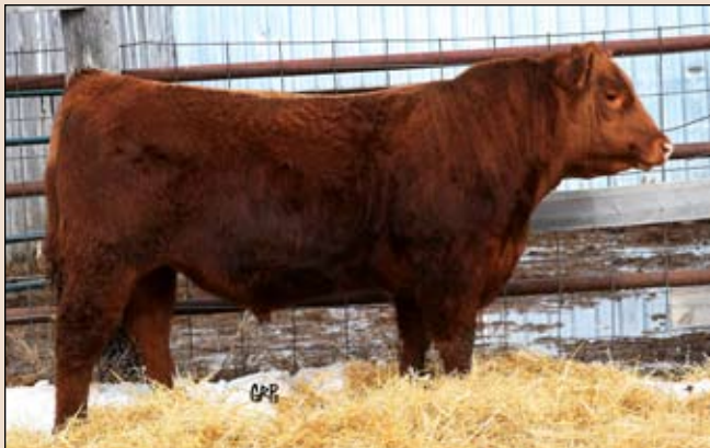
Lot 23: Splits 17W