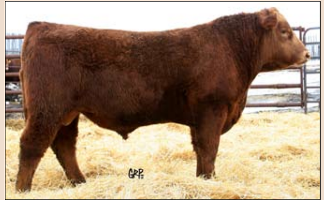
Lot 7: Moliter 12W