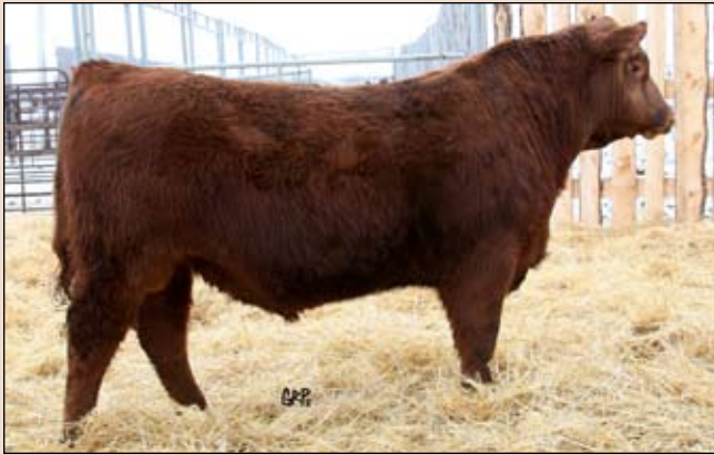
Lot 3: Columbian 51W