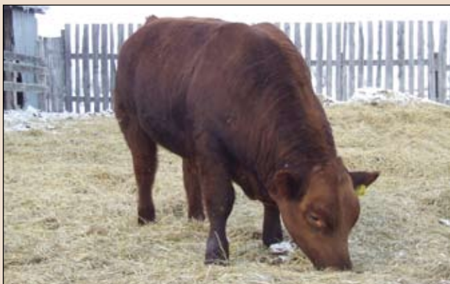
Lot 27: Sabre 28W