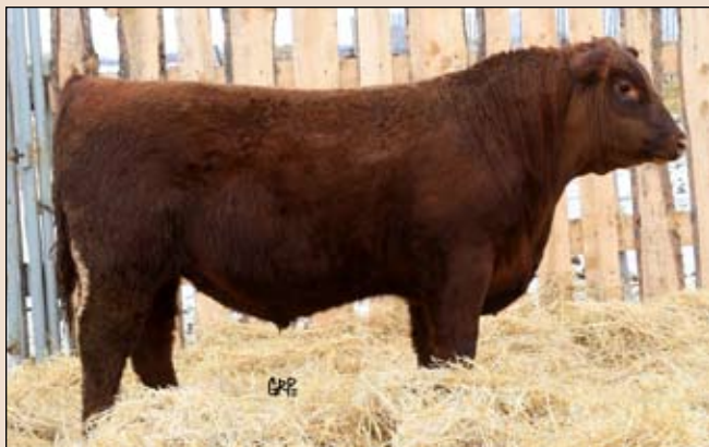
Lot 19: Gordy 18W