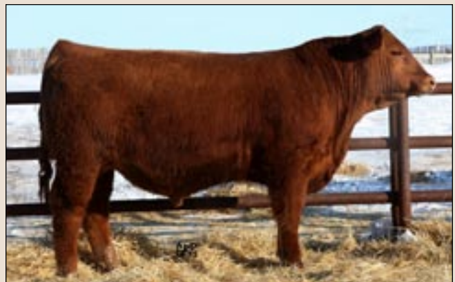
Lot 28: Mulberry 108U-ET