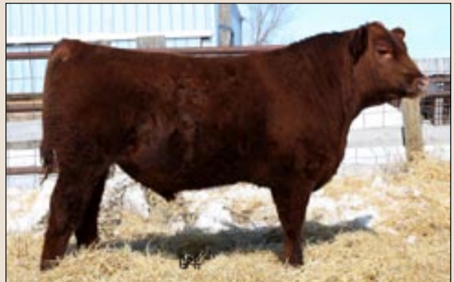
Lot 29: Legacy 98U-ET