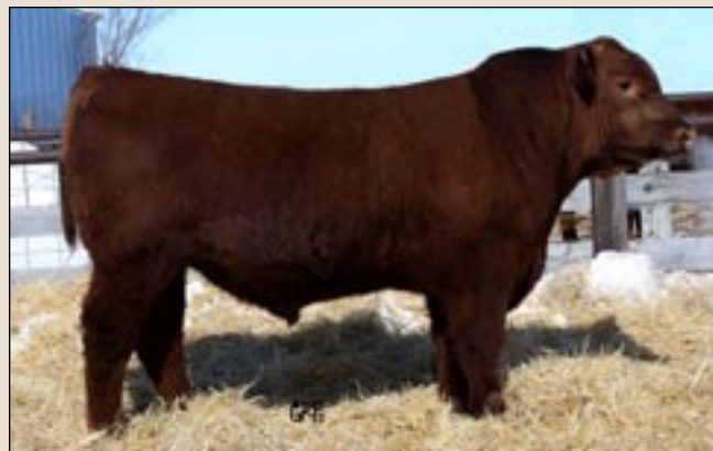
Lot 31: Tandem 5U