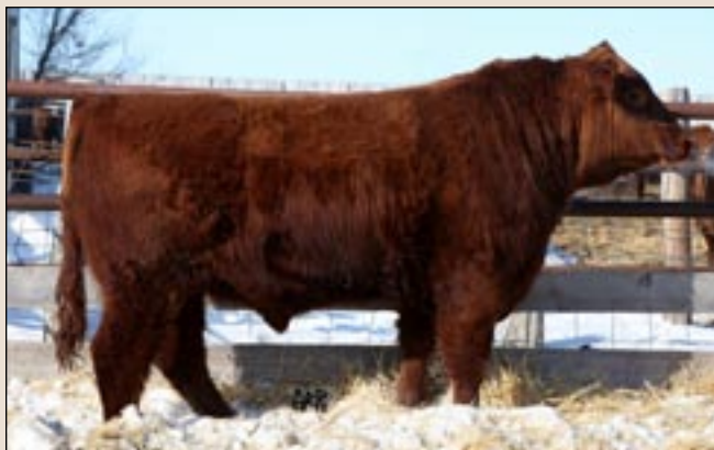
Lot 26: Tyrese 51U-ET