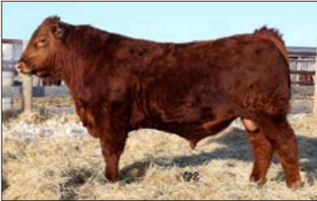
Lot 3: Columbian 25U