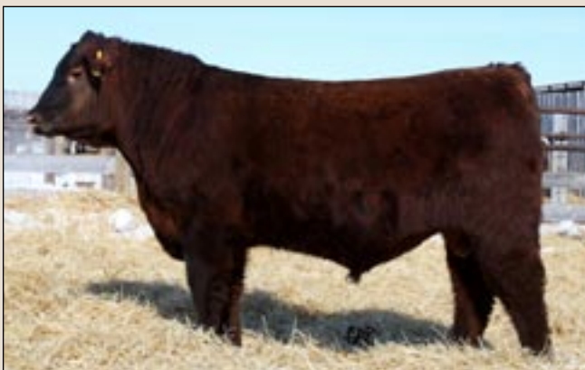
Lot 27: Primal 96U-ET