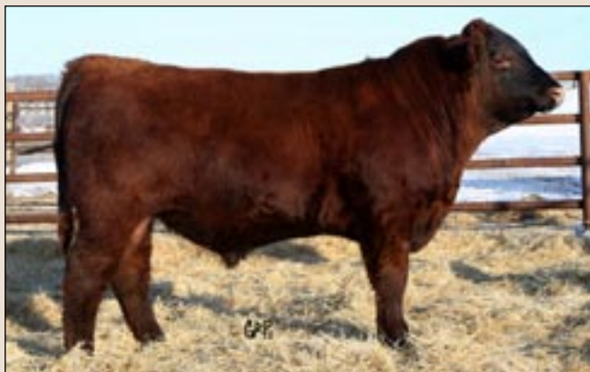
Lot 19: Impressive Mex 750U