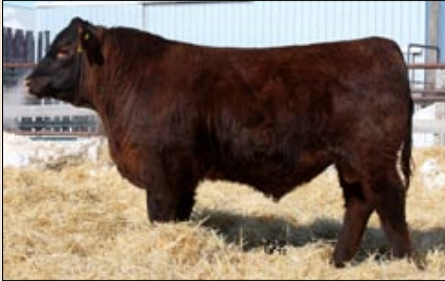
Lot13: Dontrel 49U