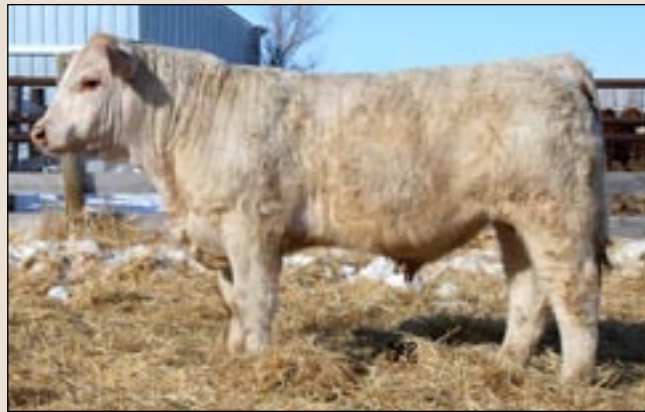
Lot 40: Revved 205U

I am certain that they will meet your approval and that the foundation has been laid for a very good complimentary breed choice in our sale.