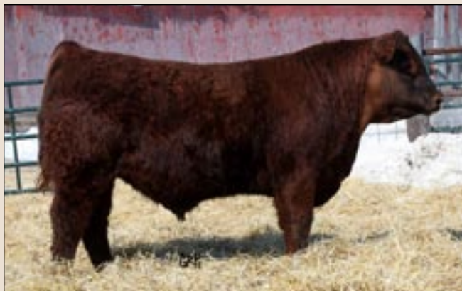
Lot 5: Bolt 92U