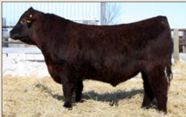
Lot 2: Luffman 69U