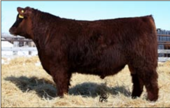
Lot 4: Vertigo 37U