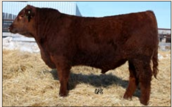
Lot 18: 731U