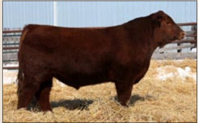
Lot 21: 741U