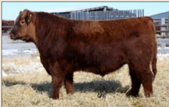
Lot 16: Vernon 44U