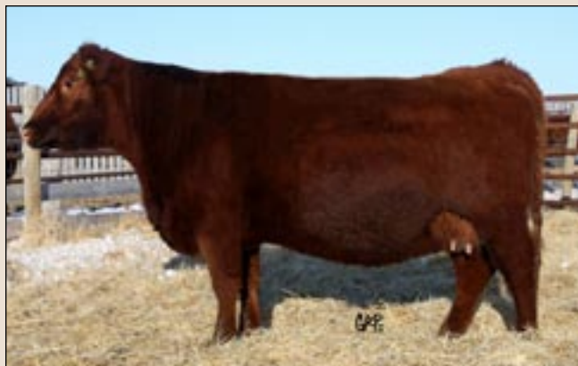
Dam of Lot 38