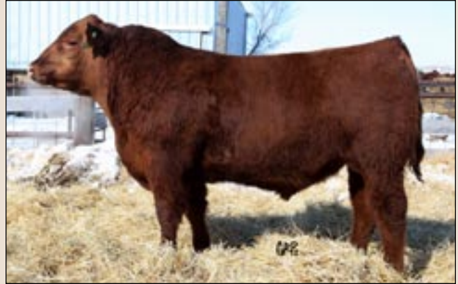
Lot 22: 717U