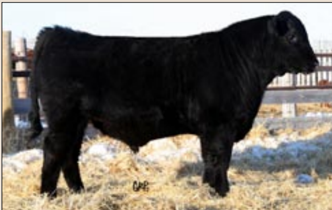
Flushmate to Lot 29