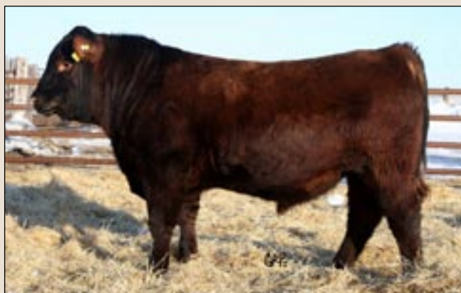
Lot 38: Medicine Man 215U

Well where do I start? Medicine Man has been an absolute stand out since birth. Muscular, deep bodied and extremely docile, he has been an easy choice in both the summer pasture and now at home in the feedyard.