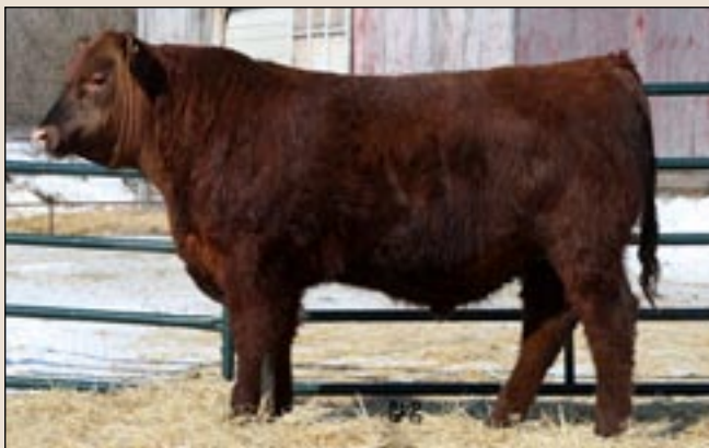
Lot 14: Trapper 31U