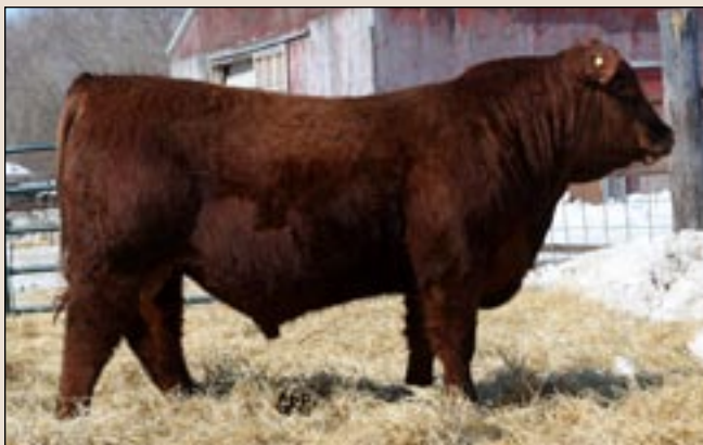
Lot 36: Ace 403U