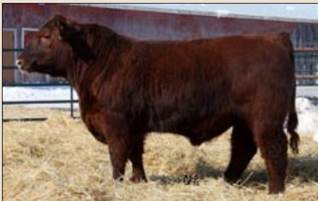
Lot 1: Rios 27U