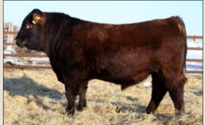
Lot 38: Medicine Man 215U

Well where do I start? Medicine Man has been an absolute stand out since birth. Muscular, deep bodied and extremely docile, he has been an easy choice in both the summer pasture and now at home in the feedyard.